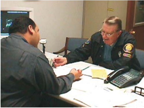
Volunteers participate in a variety of ways.

Volunteers participate in nonhazardous law enforcement activities in support services and operations.