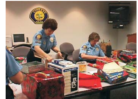
Volunteers help with special projects.

The mission of the Cypress Police Department: