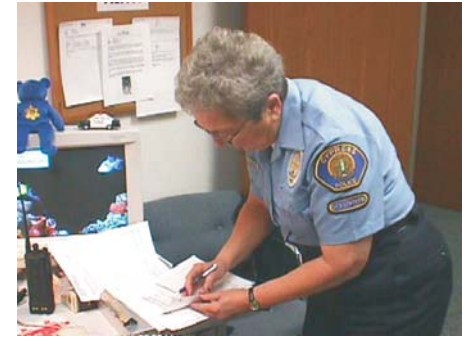
Volunteers assist with recordkeeping.